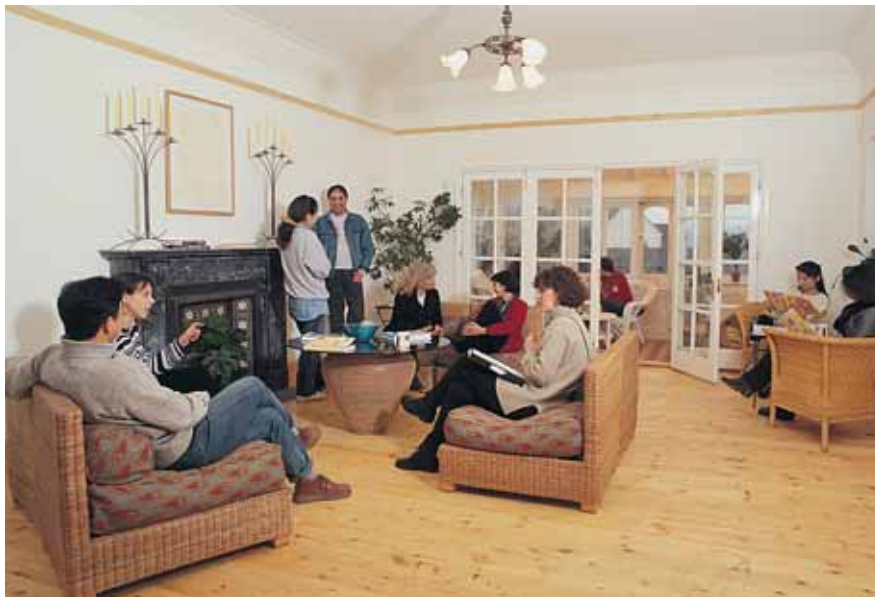
A Student lounge

Various reference, grammar and vocabulary books, listening and pronunciation tapes, computer programmes, Examination and Business materials. In addition, there is information on British Culture, a library of readers, videos and DVDs.