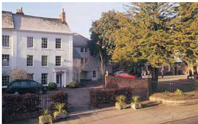
The Globe reception