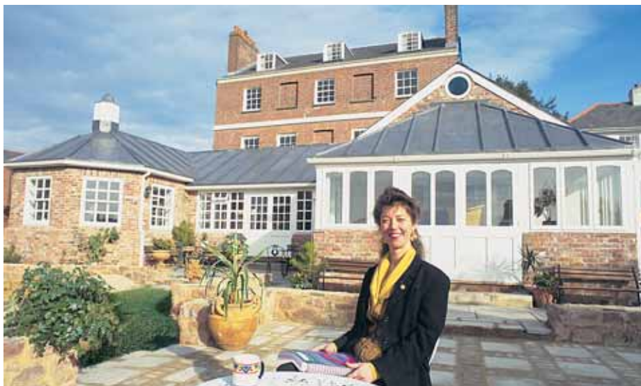
The Director outside the School's garden rooms