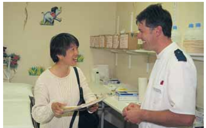
Student on a professional visit

We can organise meetings, visits or placements in organisations working in the same professional field as you. We can put you in touch with local companies for possible future business links. You should apply for such visits when booking your course.